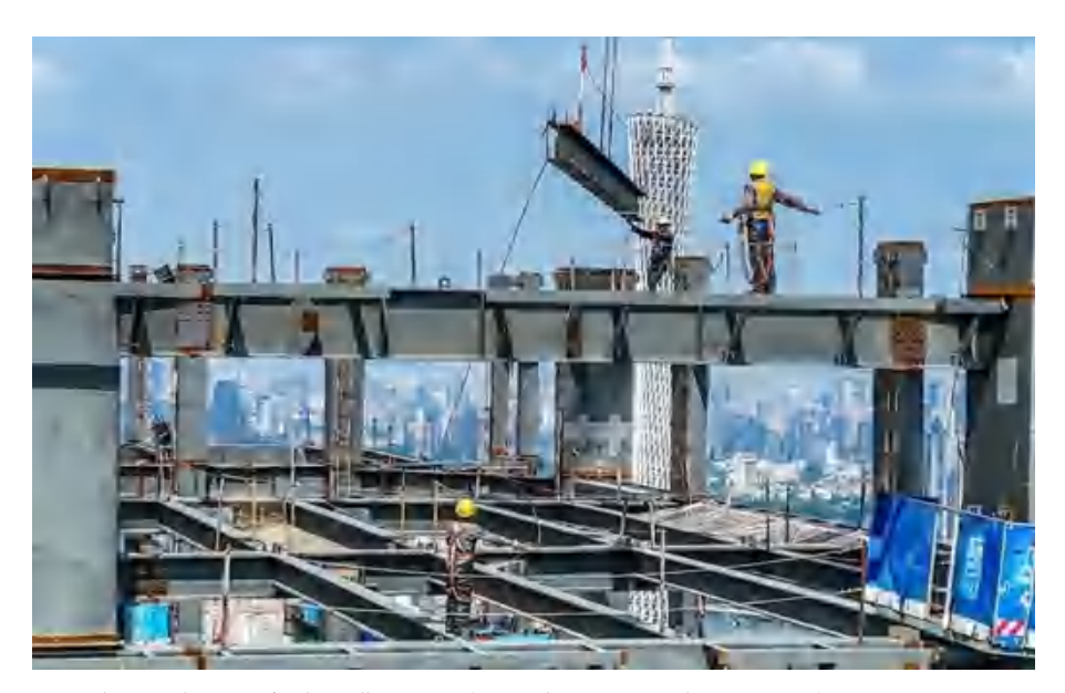
Guangzhou Pazhou Artificial Intelligence and Digital Economy Pilot Zone under construction, Sept. 3rd ,2022.

Digital Literacy and Skills for All," "14th Five - Year Plan for the National Informatization," and the "14th Five - Year Plan on Digital Economy Development" all make it clear that the Chinese government will enhance digital literacy and skills for all, and clearly state that priority will be given to building a national digital skills education resource system, carrying out digital skills education and training, helping the digitally disadvantaged, as well as giving guidance to promote the development of digital green manufacturing.