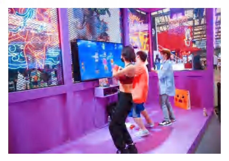
On July 30, 2021, Shanghai, the nineteenth ChinaJoy was held in the New International Expo Center. The picture shows the audience experiencing the dance fitness game.

the "Work Plan for the Promotion and Use of the Maternal and Child Health Handbook", which provides systematic and standardized services for mother and child throughout the whole process of pregnancy and childbirth by using a unified Maternal and Child Health Handbook