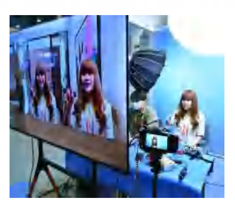
On September 9<sup>th</sup>, 2022, Attendees experienced the metaverse live broadcast at China International Fair for Investment and Trade in Xiamen. In the past ten years, the number of Chinese mobile Internet users has increased by more than 600 million.

(1) Develop new business models and modes in rural areas. Measures are taken to develop agricultural e commerce, establish and publicize the brands of featured agricultural products through the internet. Measures are also taken to cultivate new modes of rural businesses. promote smart rural tourism with a number of well-equipped, multifunctional, intelligent and convenient leisure and tourism parks, rural B&Bs, forest houses and recreation bases built. Platform enterprises such as shared farms, cloud farms, online tourism, e - commerce, location information services, social media, smart finance are encouraged to provide their products and services to the countryside. E - commerce training programs are carried out for rural youth, including rural women. The All-China Youth Federation has "Youth Agriculture established the