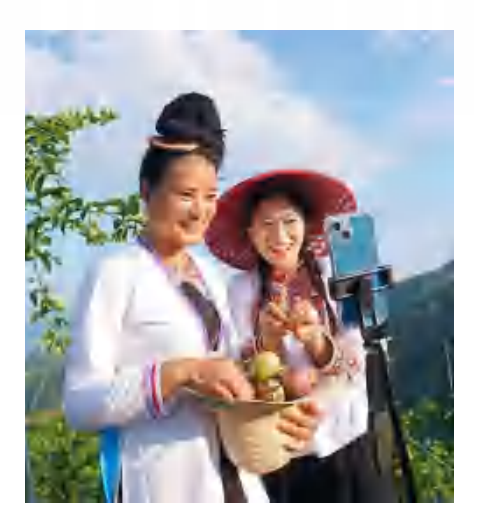
On July 25<sup>th</sup>, 2022, Guizhou Qiandongnan Miao and Dong Autonomous Prefecture, Cong Jiang County, Luo Xiang town, Shang Pilin village passion fruit base, villagers were on live to sell local agricultural products via cell phone.

(4)Provide specific help for the digitally Resources disadvantaged. are mobilized from all stakeholders to carry out regular digital skills support for groups such as low -income groups, the elderly, the disabled, orphans, left-behind children, children in low-income families and residents of remote areas and areas newly out of poverty, so as to effectively improve level the literacy of digitally disadvantaged groups in the fields such as the use of digital devices, access to online services, digital consumption, and online fraud prevention.