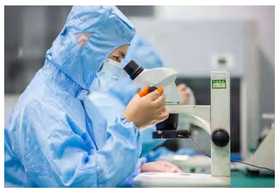
On August 29, 2022, workers were making filters in the workshop of Nantong Risen Optical Co. in Qutang Town, Haian City, Jiangsu Province.

(1) Carry out vocational skills enhancement activities and provide digital skills training for the youth. "Internet + Vocational Skills The Training Program" and the "100-day Free Online Skills Training Action" were launched to provide digital training for young people in more than 100 occupations, especially in fields such as artificial intelligence, big data, cloud computing, etc. Since 2019, new occupations relevant to