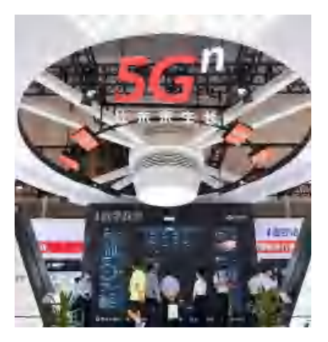
On September 2<sup>nd</sup>, 2022, visitors learned about 5G communication technology at the 2022 World Digital Economy Conference and the 12th Smart City and Smart Economy Expo in Ningbo, Zhejiang Province.

Secondly, the absence of a global digital governance system poses an obstacle to the balanced and inclusive development of youth digital literacy and skills. The current global governance mechanism seriously lags behind the development of the global digital economy. Countries have difficulty in reaching consensus on establishment of the core the mechanism of global digital governance, and multilateral cooperation and negotiation is