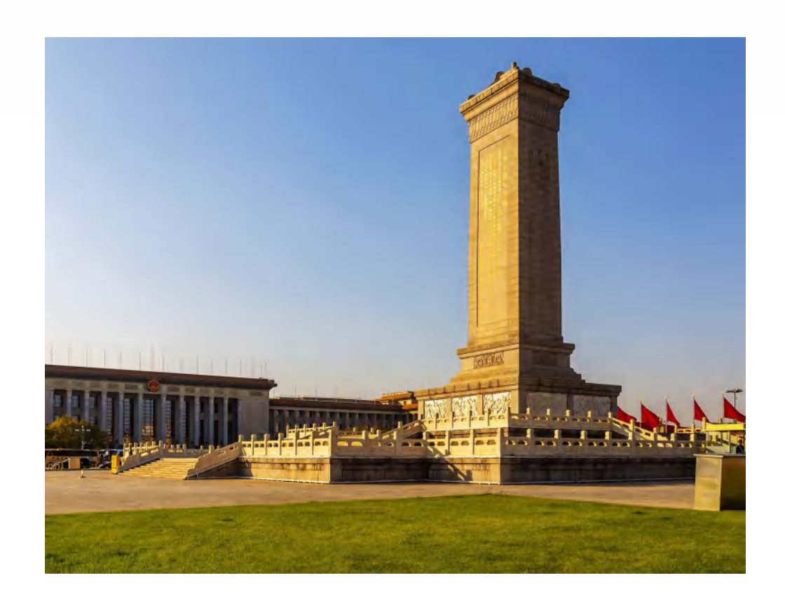
Video: What's 20th CPC National Congress? – Chinadaily.com.cn (https://www.chinadaily.com.cn/a/202210/10/WS634366ada310fd2b29e7b7e3.html)

Speaking at a workshop attended by senior Party and government officials in July, Xi Jinping, general secretary the CPC Central Committee, said the 20th CPC National Congress would emphasize strategic tasks the Party will have and the major steps it will take over the next five years, which hold the key to the country's modernization drive. effort must be made to work out new plans and measures to tackle the problem of unbalanced and inadequate development nationwide, Xi said.